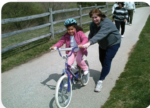
EIDM module uses realistic scenario as a model

Watch for a feature on our learning modules in the next NCCMT newsletter!